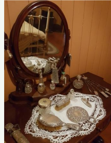
Above: In the bedroom, a late 19th century mahogany dressing table displays items that were in frequent use by ladies of that era.