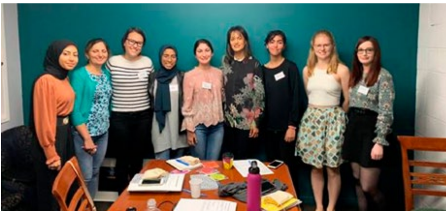
National Council of Young Women of Queensland (NCYWQ)