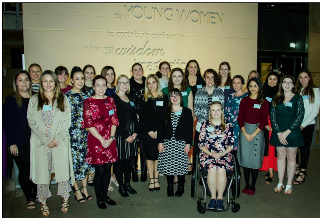
2019 Bursary Recipients attending the presentation on Tuesday 23 July

Held on Tuesday, 23 July, at Brisbane Girls' Grammar School, the Barbara Fielding Room was filled with about 130 people to share in the event. The awarding of inaugural bursaries is always special, and we thank those new sponsors for their participation. Most new sponsors are affiliated organisations of NCWQ.