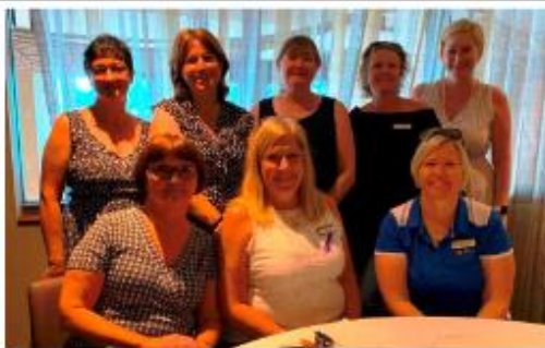
A group of some of the 190 guests at the QI Redcliffe Breakfast