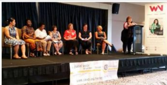
Guest Panel at the SIMNI Be Inspired 7 th Annual IWD and Awards