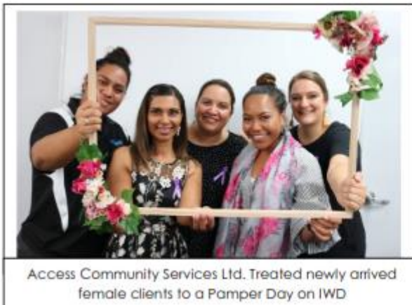
Access Community Services Ltd. Treated newly arrived female clients to a Pamper Day on IWD