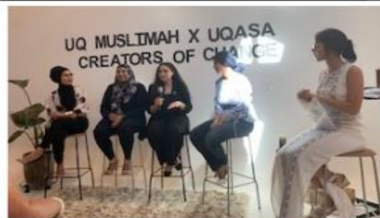
UQ Muslimah Society in Collaboration with the UQ Student Associated hosted over 100 guests at their IWD event, featuring the Creators of Change Panel