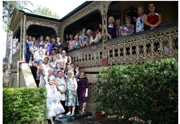
Guests on the steps of Miegunyah