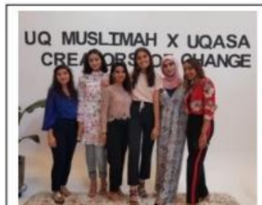
UQ Muslimah Executive Committee