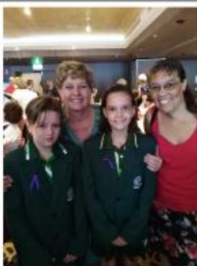
Left: Hercules Road Students and Teachers at the QI Redcliffe Breakfast