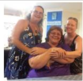
Soroptimist Sisters from New Zealand, Australia and Canada celebrate together.