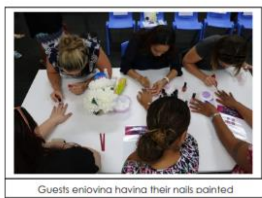
Guests enjoying having their nails painted