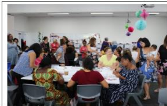
Access clients were able to have their eyebrows threaded, make their own hand lotion, create jewellery and choose clothes from the Access Boutique