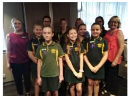
Right: Clontarf Beach State School Students