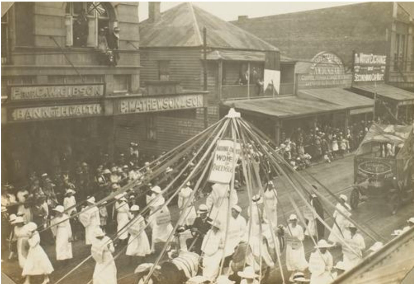
Peace procession in Wickham Street, Fortitude Valley, Brisbane, after World War I in July 1919